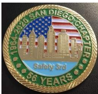
Chapter Challenge Coin

CLICK ON THE TOPIC TO JUMP TO THAT PAGE!